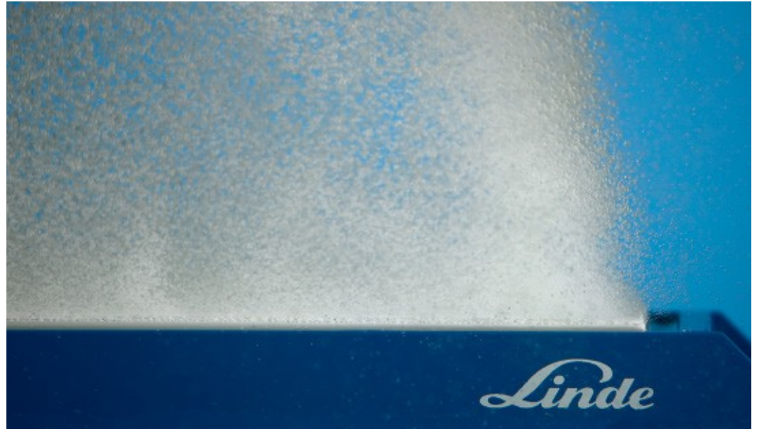
SOLVOX® ceramic diffuser in operation